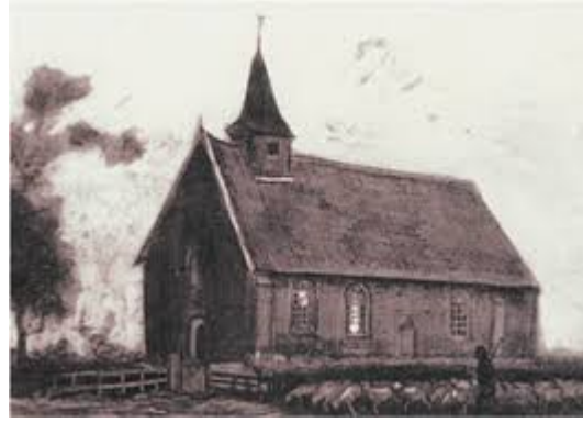
The little church of Zweeloo, as painted by Vincent van Gogh