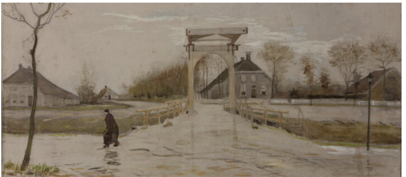
The bridge in Veenoord painted by Van Gogh