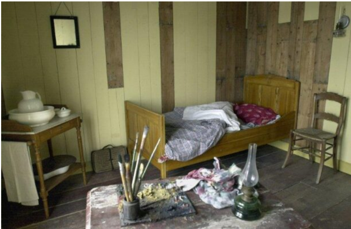
Van Gogh's room in Veenoord