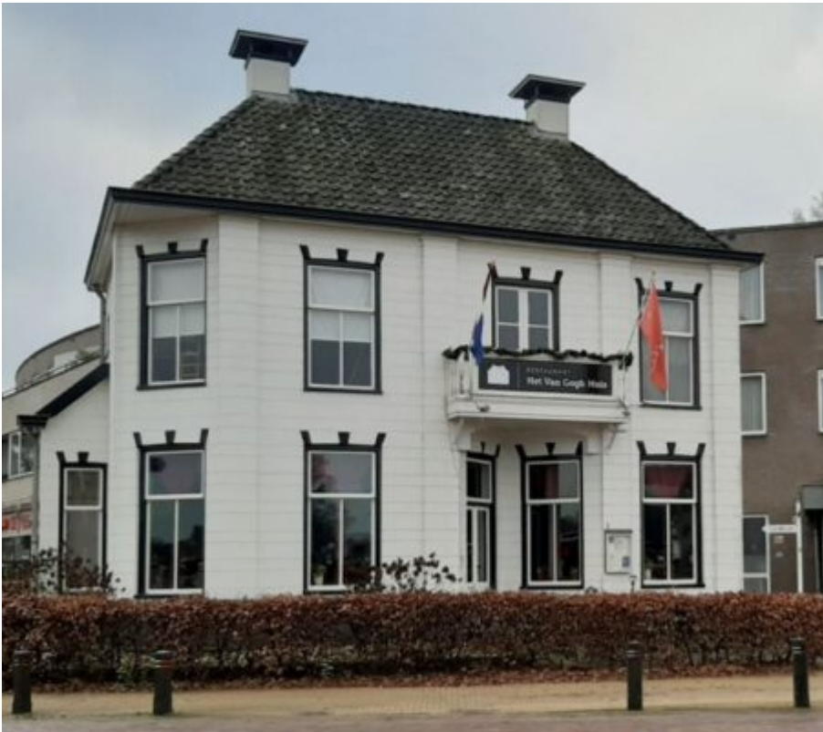
The Van Gogh house in Veenoord

The Van Gogh House is the only house in the Netherlands open to the public in which Vincent actually lived and worked. All visitors to the house are taken on a personal guided tour which includes the café and Vincent's bedroom and also watch a short film. Many articles and gifts are available in the shop. The reception area is home to the Expedition Gateway to 'Artists on the Hondsrug'. Information about the nine hotspots in this story line gives visitors an impression of what they can see at each location.