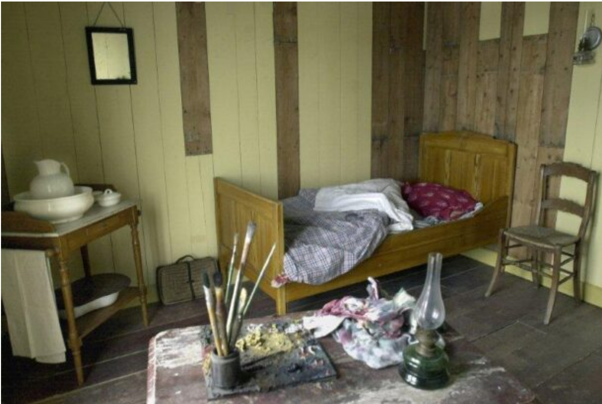
Van Gogh's room in Veenoord