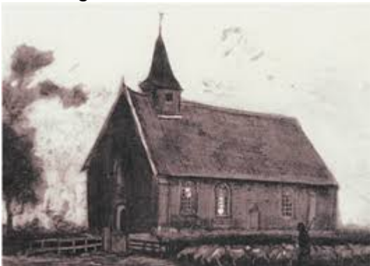
The little church of Zweeloo, as painted by Vincent van Gogh