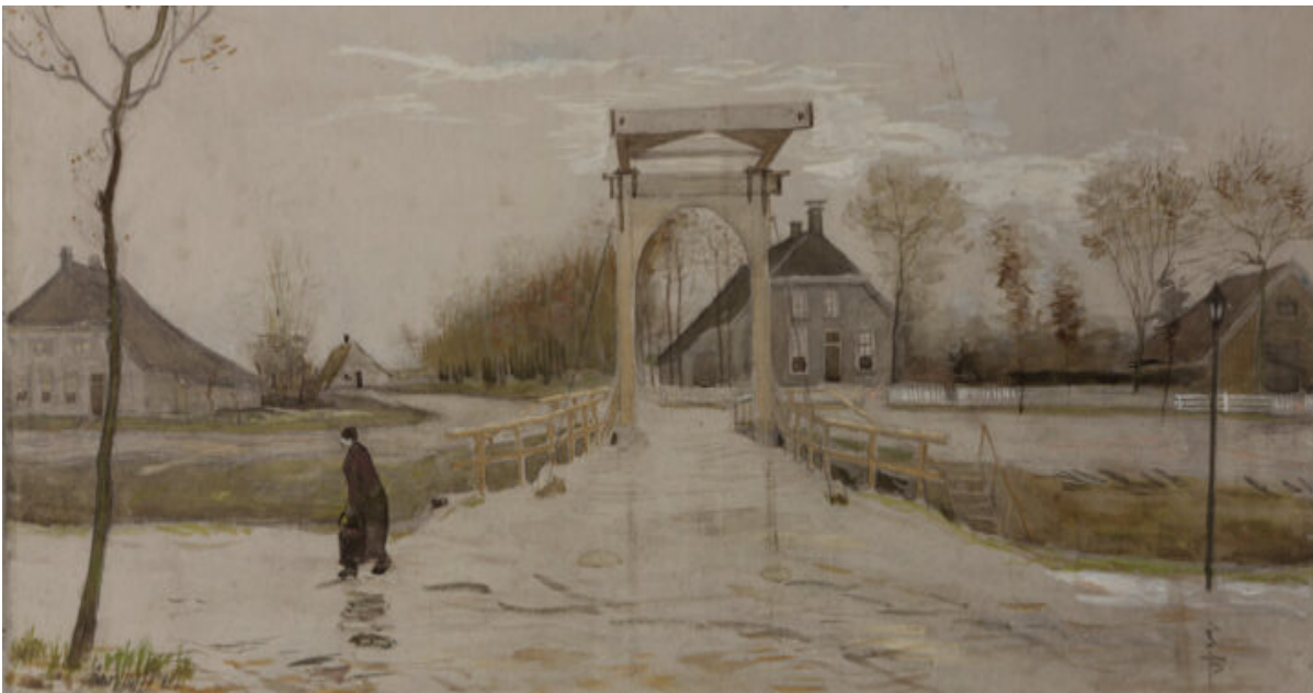
The bridge in Veenoord painted by Van Gogh